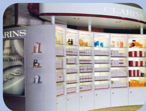
↑Bonding shop fittings