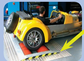
↑ Bonding panels around rolling rod