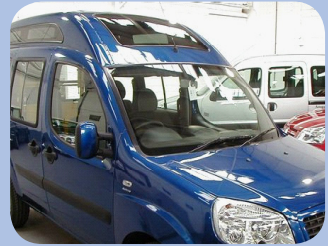
↑ Vehicle conversions