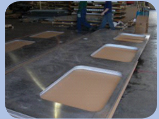
↑ Bonding Bus Panels