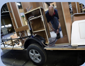
↑Bonding caravan interiors