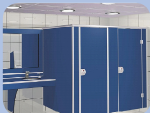
↑Bonding partitioning composites