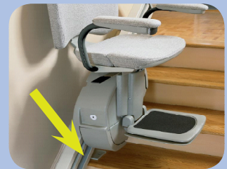
↑ Bonding Stair Lift Rails